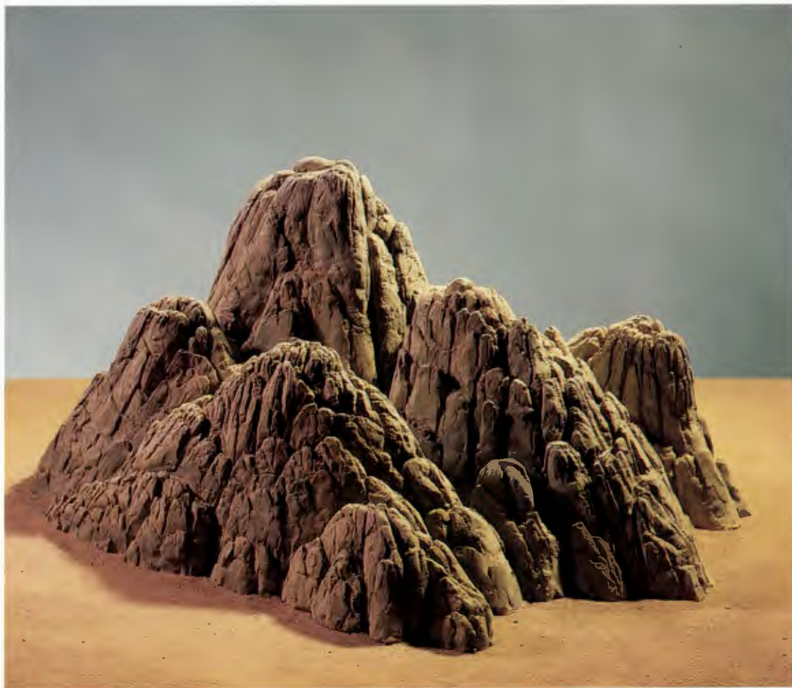
Rocks I, 1984