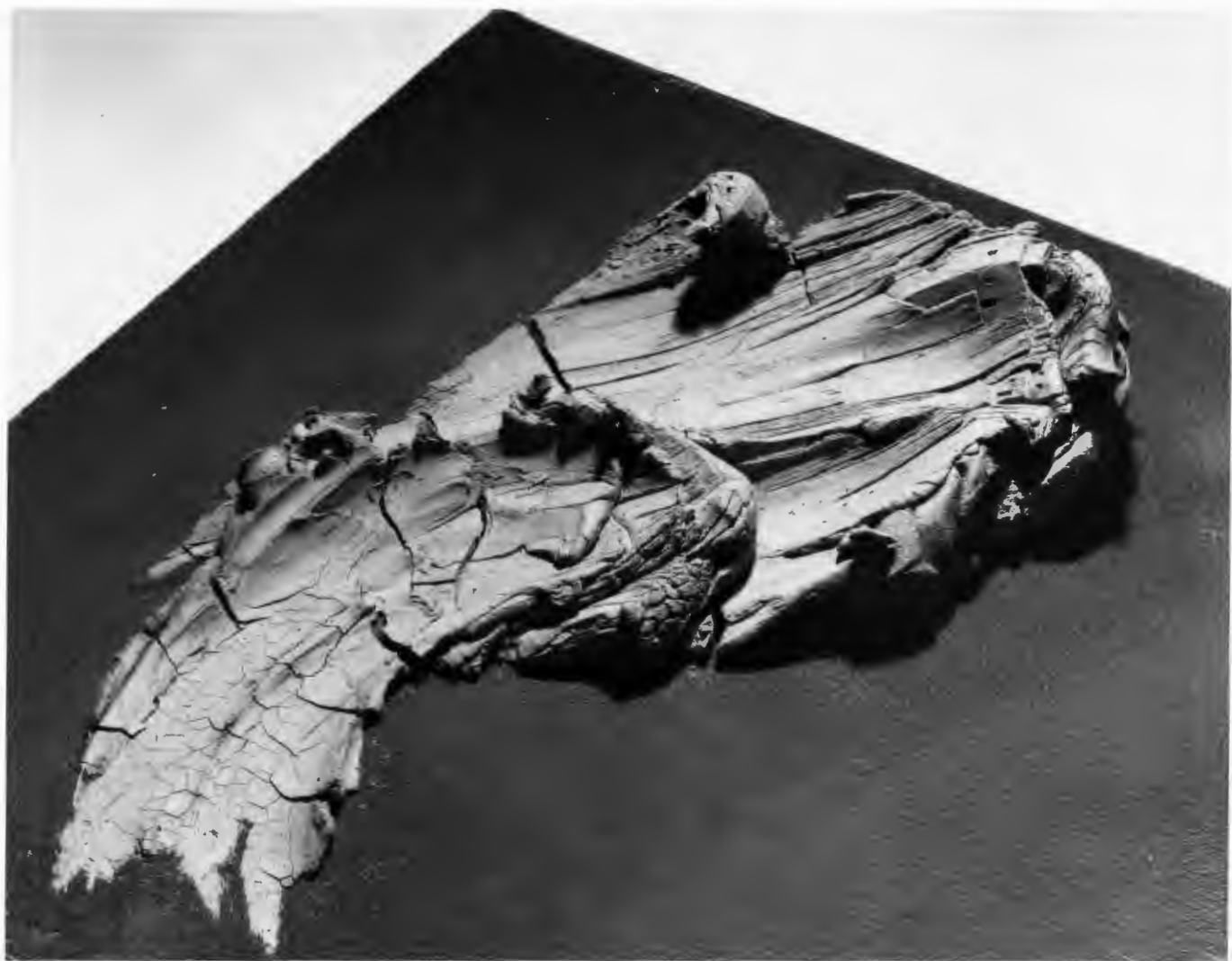
Smear I, 1984