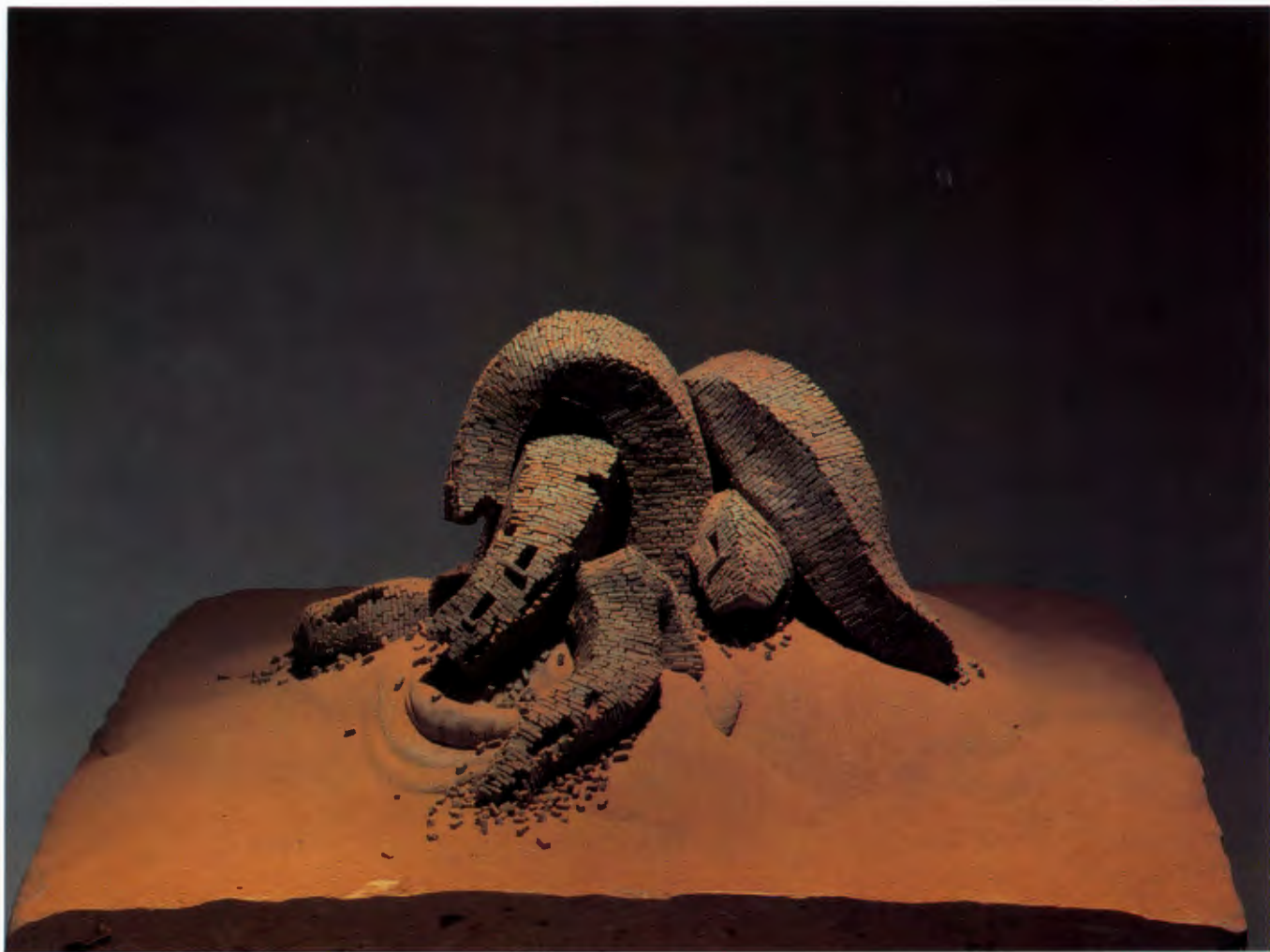
Wilted Towers, 1984