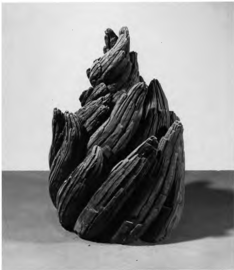
Rocks V, 1984