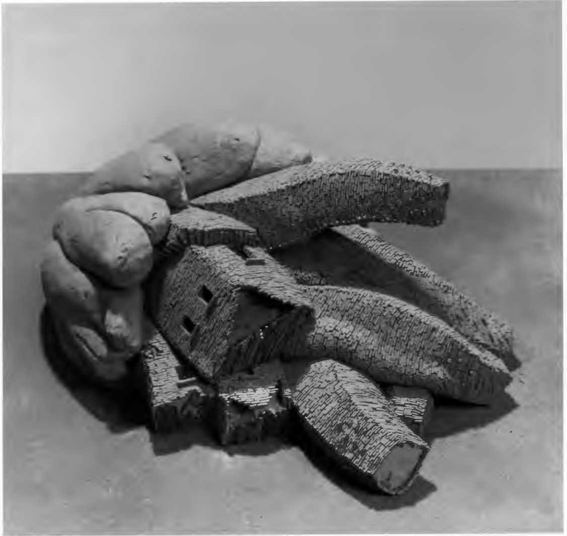
Pod II, 1984